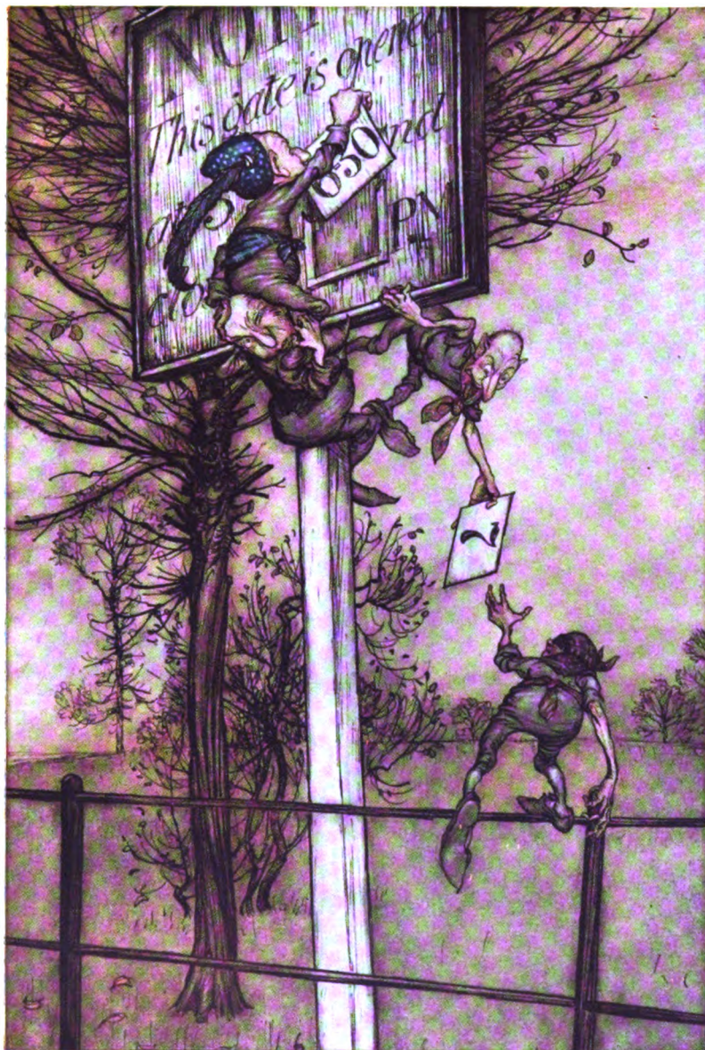
These tricky fairies sometimes change the board on a ball night.