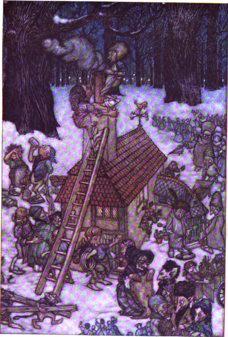
Building the house for Maimie.