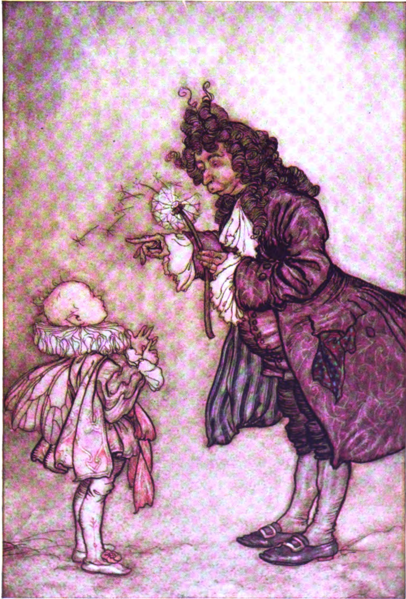
When her Majesty wants to know the time.