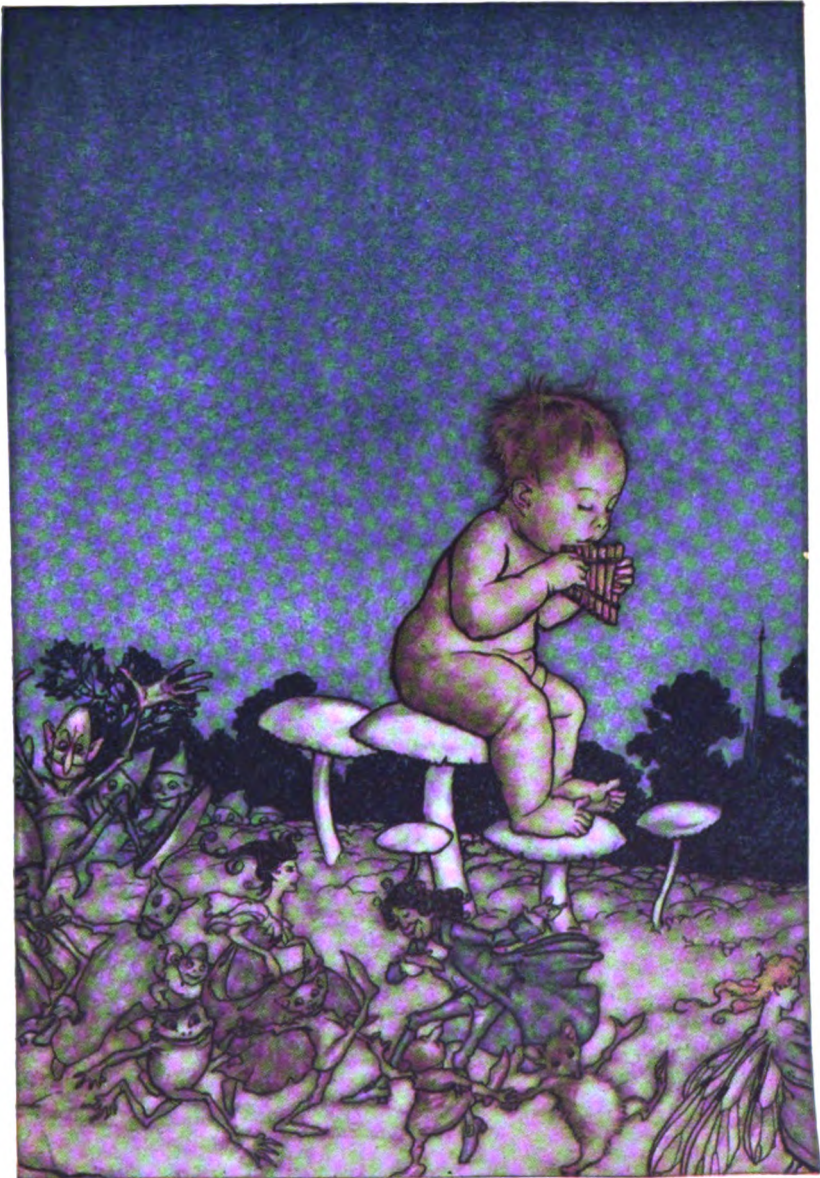
Peter Pan is the fairies' orchestra.