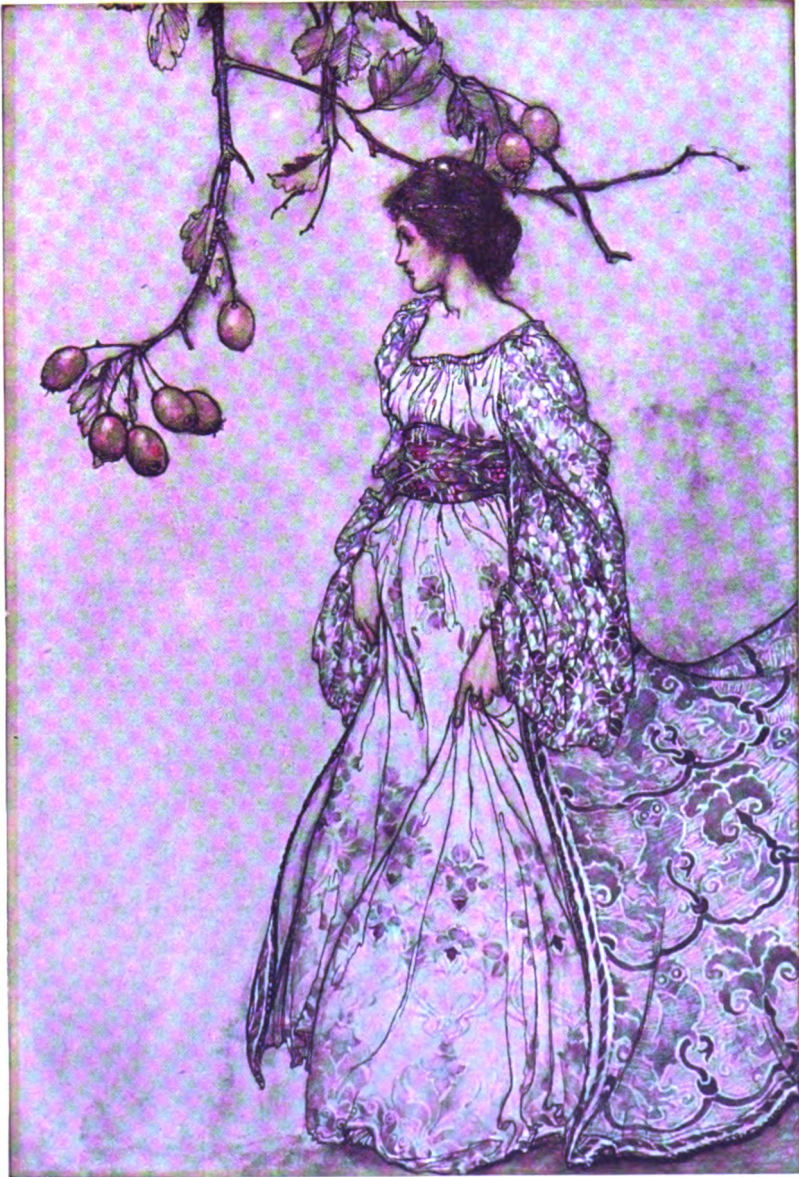
Looking very undancey indeed.