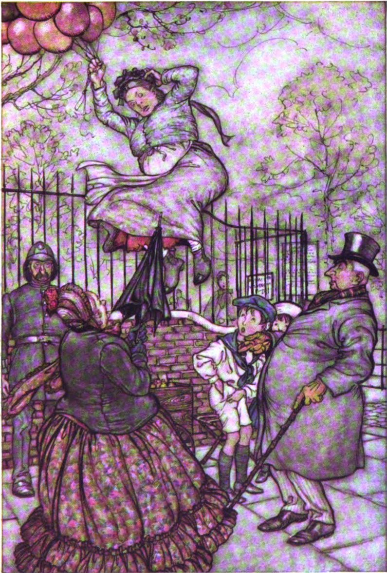
The lady with the balloons, who sits just outside.